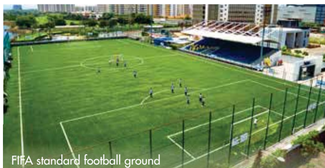
FIFA standard football ground